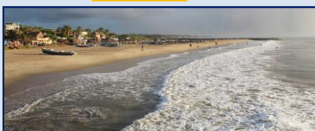
SERENITY BEACH MAHABALIPURAM (90Kms from Puducherry)